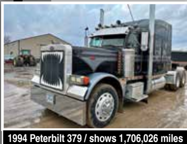
1994 Peterbilt 379 / shows 1,706,026 miles