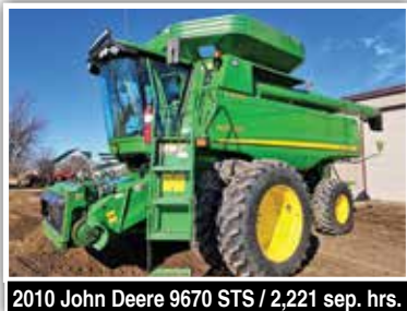
2010 John Deere 9670 STS / 2,221 sep. hrs.