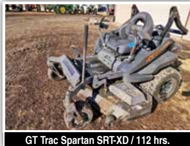
GT Trac Spartan SRT-XD / 112 hrs.