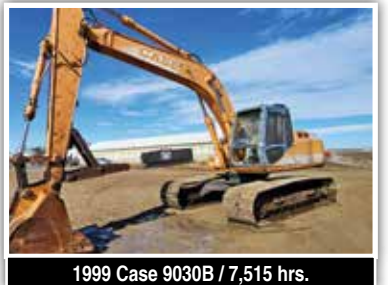
1999 Case 9030B / 7,515 hrs.