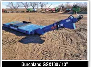
Burchland GSX130 / 13"