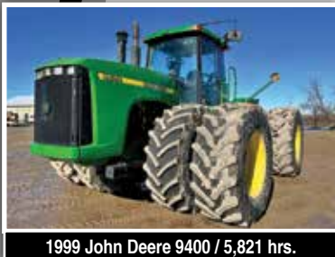
1999 John Deere 9400 / 5,821 hrs.

TRACTORS, COMBINE, HEADS & HEAD TRAILERS, PLANTER & DRILL, SEED TENDER, TILLAGE, EXCAVATOR, DOZER, SKID STEER & ATTACHMENTS, SEMI TRUCKS & TRAILERS, PICKUP TRUCKS, UTV & ATV, AUGERS, GRAIN CART, GRAVITY FLOW WAGON, ROTARY MOWER, GRAIN DRYER, GRAIN VAC, MANURE SPREADER, TECHNOLOGY AND MORE!