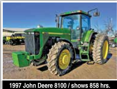
1997 John Deere 8100 / shows 858 hrs.