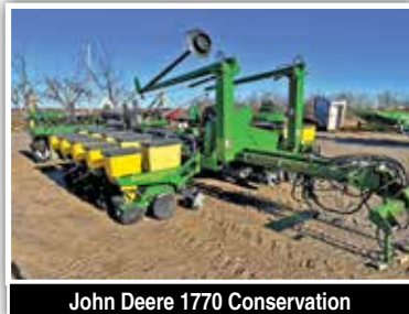
John Deere 1770 Conservation