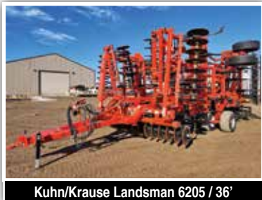
Kuhn/Krause Landsman 6205 / 36'